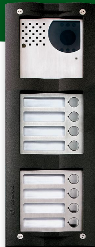
VIDEO INTERCOM COMPOSITION

Solid and antivandal modular door station series, elegant and reliable with push buttons and modules in stainless steel. Matrix is conceived to be resistant to breaking, water spout and solid penetration, it's guaranteed by IP45 degree for solid items introduction protection and by IK09 degree for mechanical shocks. All the modules are backlit thanks to green LED's for easy identification especially in poorly illuminated situations. The modularity allows installations of great number of users and configurations in vertical or horizontal way. The range is complete with aluminium die cast frames, rain shelters and built-in boxes. In a single module can be integrated push button, door speaker and camera, so that Matrix can be the ideal solution starting from one-way installations up to the most complex cases.