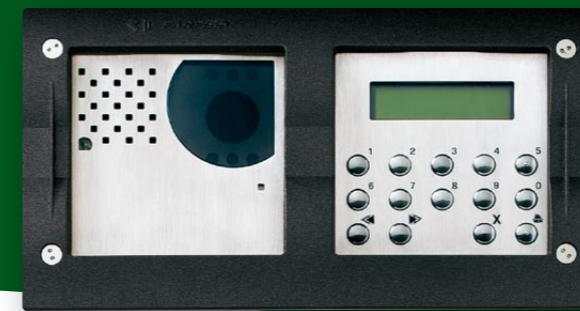
VIDEOINTERCOM COMPOSITION WITH DIGITAL CHIME

MA43ED With door speaker and chime button for 4+1 electronic call video system without coaxial cable camera | black/white / fixed 3.6 mm lens l w x h | 115 x 115